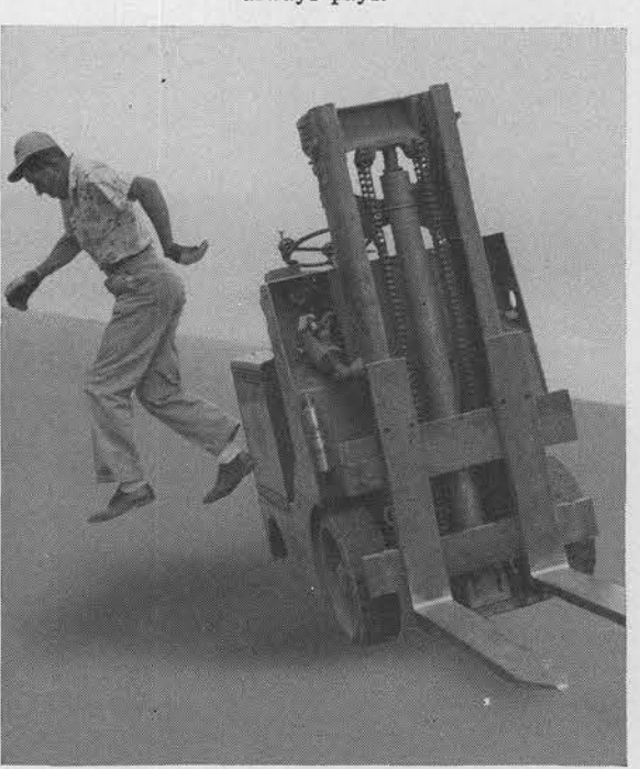
SHADES OF Barney Oldfield, only here we demonstrate with a fork lift. Excessive speed and a fast corner mean an overturned fork lift and probable injury. It has happened here.